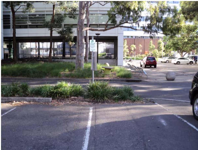
Alternative location 1: Opposite Australian School of Business.

If the preferred space is deemed unworkable, bays could also be allocated in the carpark opposite the Australian School of Business.