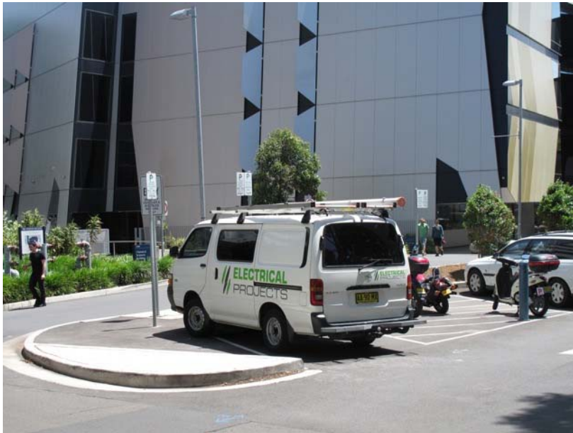
Proposed location: Material Sciences Building opposite Law Building

Location 1: The surface carpark on the corner of Union Road and Gate 2 Avenue, closest to the Material Sciences building and opposite the Law Building. In order to ensure that the vehicles are easily located, and to promote the service, the high visibility locations next to the footpath would be preferred.